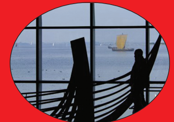
Viking ships in Roskilde