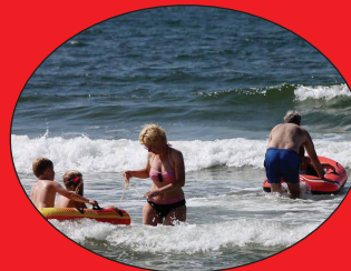
Long beaches in Western Jutland

If you want a break from the amateur radio Denmark offers very many tourist attractions: