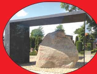
1000 year old rune stones in Jelling