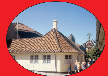
H. C. Andersens house in Odense

... and much more - see www.VisitDenmark.dk