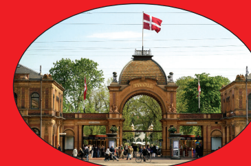
Tivoli in Copenhagen

... and much more - see www.VisitDenmark.dk